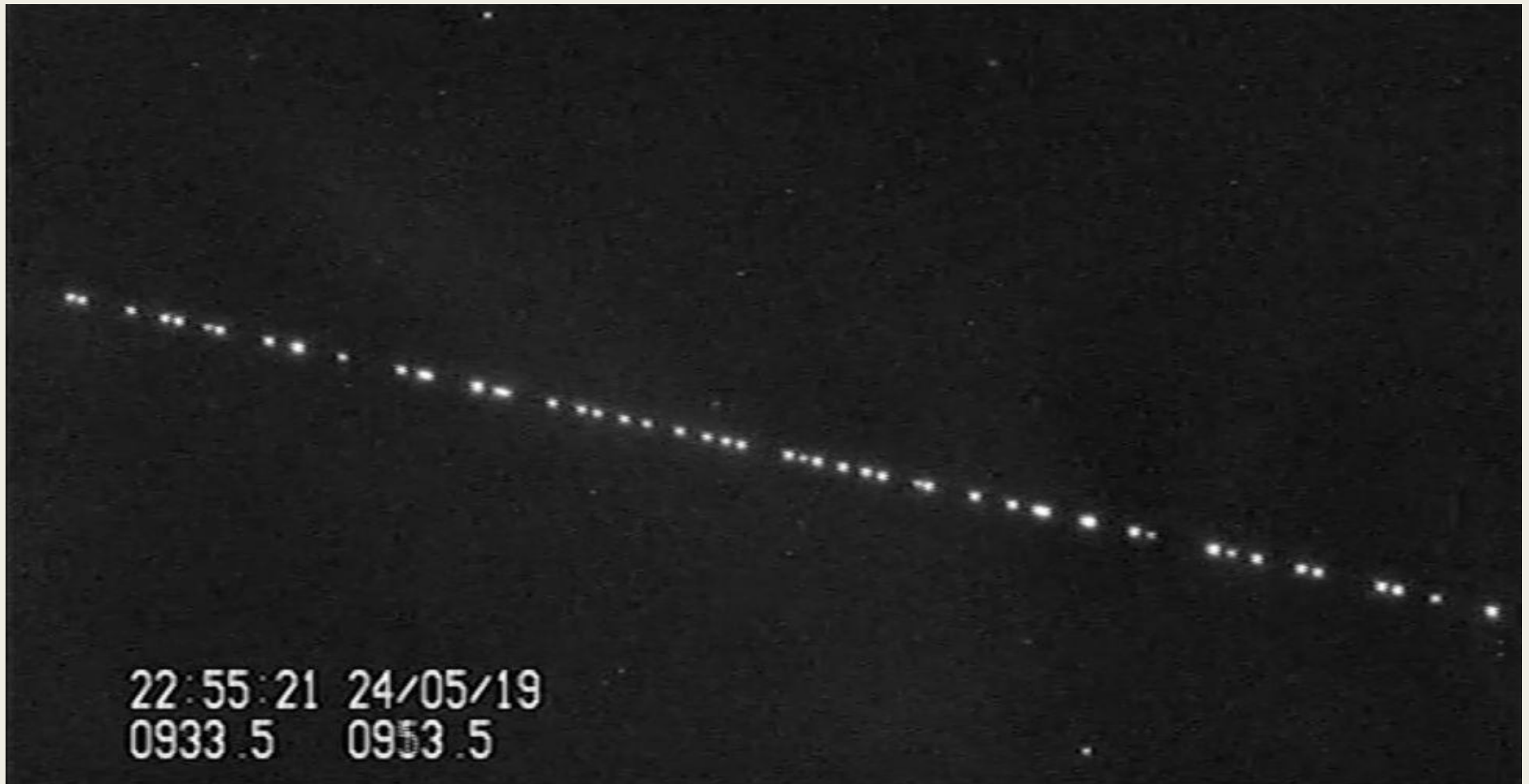
SpaceX's Starlink satellites visible in the sky