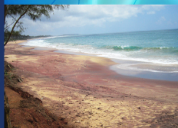
(2)a Kirinda Garnet Sand