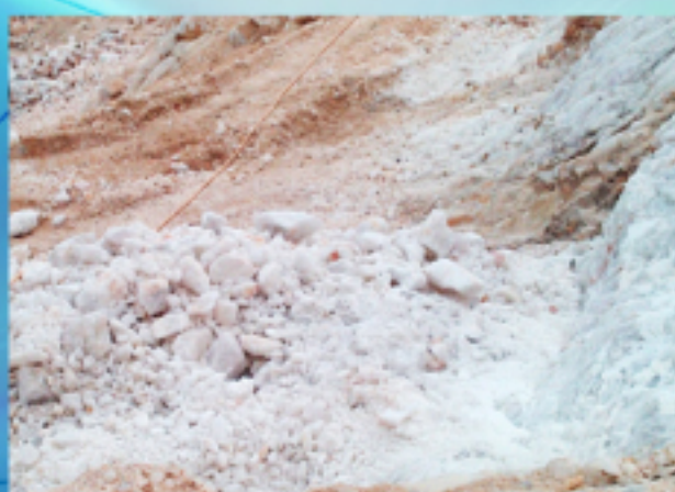
(2)b Kotikambokka Quartz