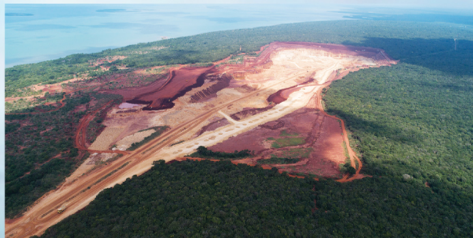
(3) Limestone & Red earth quarry at Aruwakkaru