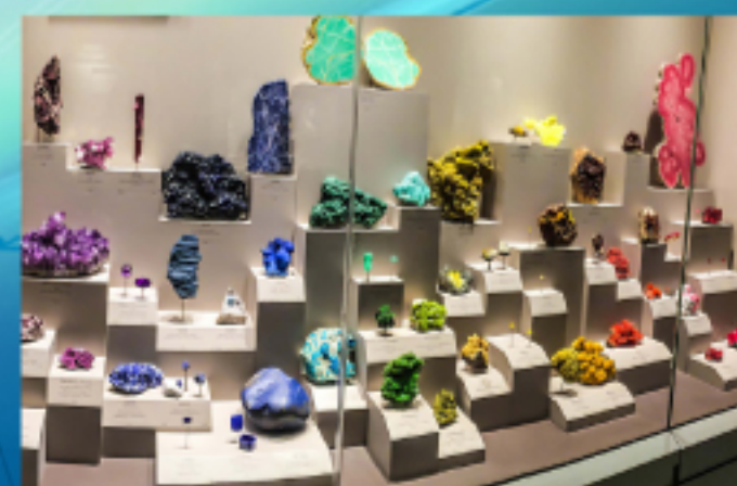
(4) Gem Museum and gemming area at Ratnapura