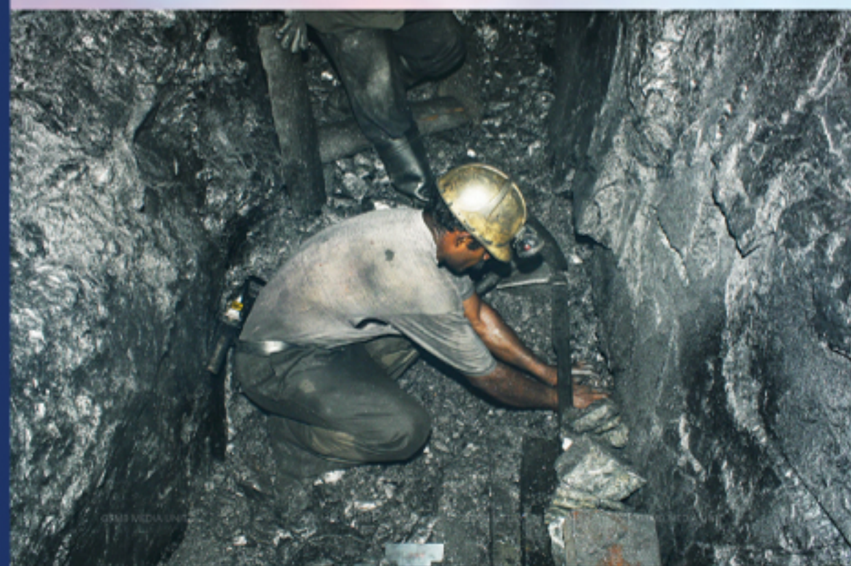
(1) Inside Kahatagaha graphite mine

Excursion ④ Gem museum and mining area around Rathnapura district, Sri Lanka (Leaving at 6.00 am from Colombo and returned back to Colombo around 7.00 pm)